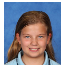
Halo 4B Instrumental