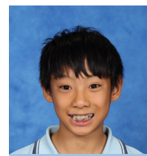
Chungte 5I Instrumental