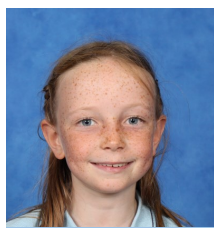
Stella 3W Technology