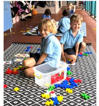
Kindergarten students enjoying the new resources donated by the P&C

In 1A and 1H, we have been learning about things that grow and change. We have been fascinated to watch the life cycle of a butterfly happening right before our eyes! The students have also been very excited to grow their own sunflowers...with varying degrees of success. The students now know, first hand, the challenges that our farmers face.