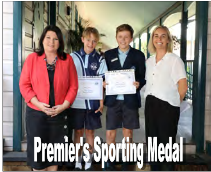
Premier's Sporting Medal

Byron Bay Public School Special Awards 2019