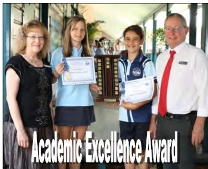
Academic Excellence Award