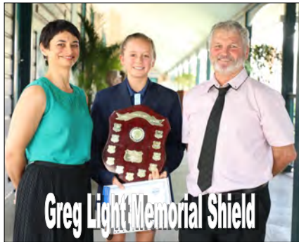
Greg Light Memorial Shield