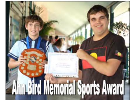
Ann Bird Memorial Sports Award