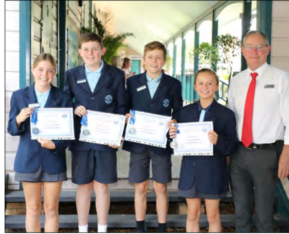
2019 Joy Graham School Captains Leadership Award