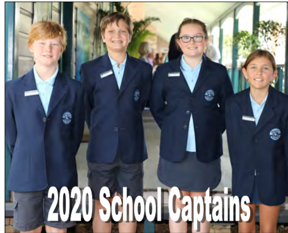
2020 School Captains