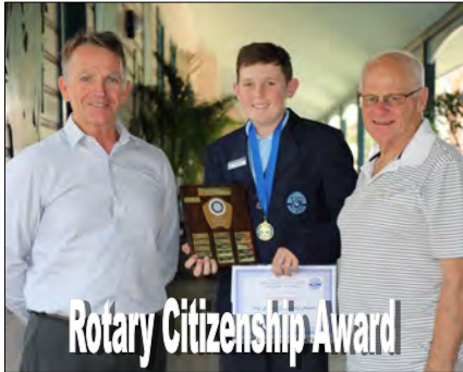
Rotary Citizenship Award