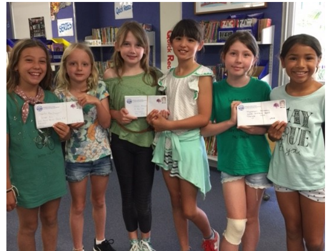
Students participating in "Friend a Farmer" pen pal initiative